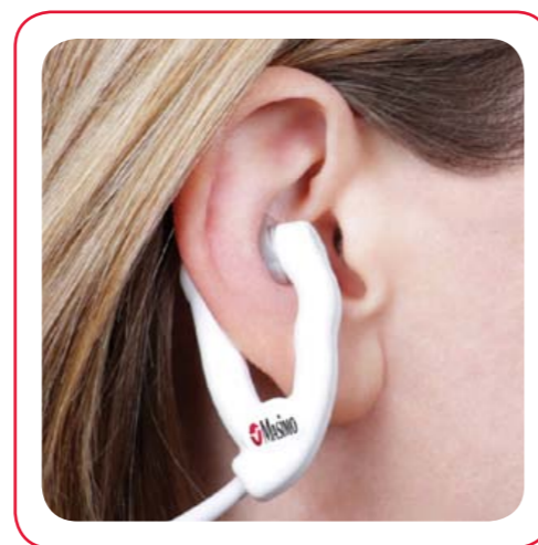
Figure 2. The tip of the E1 sensor is placed on top of the high perfusion area in the Cavum Conchae.